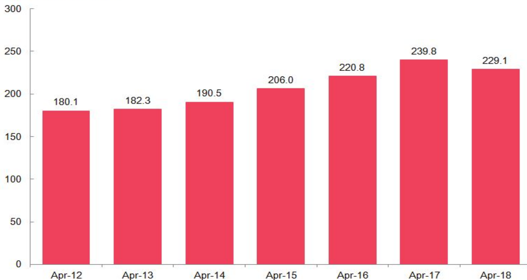
Tourists in hotels (thousands)